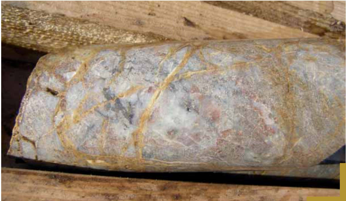
Gold-Bearing Quartz- Adularia-Sulphide Mineralisation at Podgorny. Sample from Drillhole PGDD-12, interval 89 m, Au 3,02 g/t, Ag 4,78 g/t.

Phase 2 drilling targeted a zone 1,000 m long and 350 m wide to a maximum depth of 300 m and comprised eight diamond drillholes totalling 1,580 m. Drillhole PGDD-57 intersected 0.9 m @ 10.0 g/t Au and 11.5 g/t Ag from 356.0 m downhole, suggesting that gold and silver mineralisation extends to considerable depth in the central zone of this prospect.