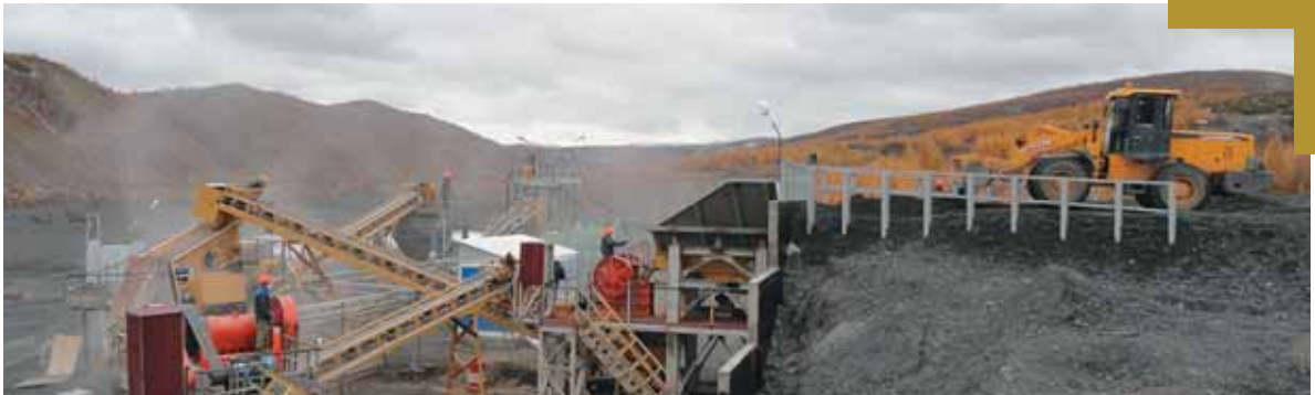
Processing plant for bulk samples at Stakhanovsky

The mineralisation wireframes have been constructed based on; diamond drilling (7,301 m), reverse circulation drilling (7,110 m), and trenches (7,281 m). Considerable portions of the resource wireframes are less than 2.0 m wide and much of this mineralisation will be uneconomic. Given that the mineralised domains are quite narrow, the proposed open pit would comprise a significant volume of waste and a high stripping ratio is anticipated.